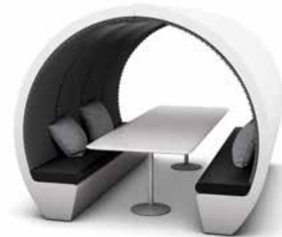
■ 8 person open