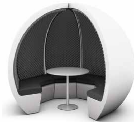
■ 6 person escape