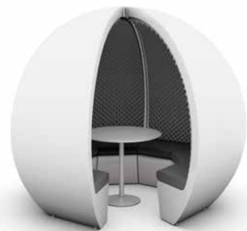
■ 7 person escape