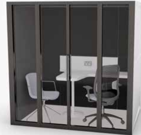
■ Private office layout, solid back panel, full glass enclosure