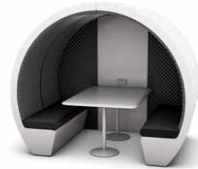
■ 4 person, acoustic back panel