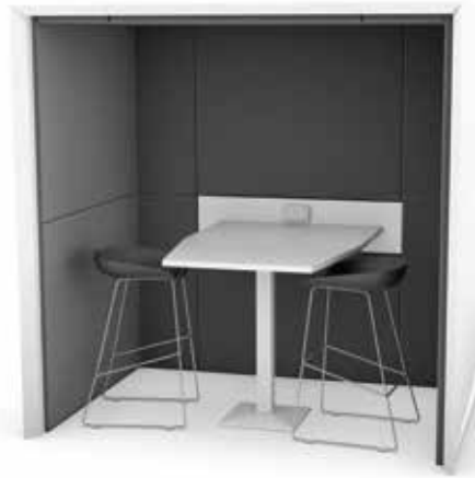
■ Coffee bar layout, fabric interior