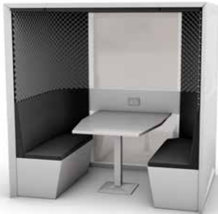
■ Standard pod 2 layout, glass back panel

With its clean linear design either as individual units or as a bank of connected pods and its multiple layout options, pod 2 is the versatile choice delivering a host of potential uses.